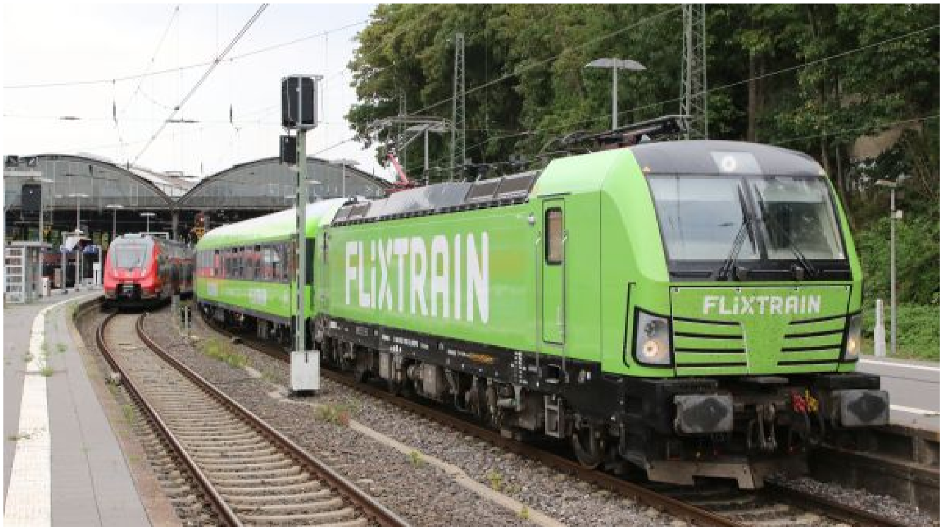
FlixTrain has refurbished its rolling stock during the pandemic.

The night train will run from Hamburg via Berlin to Munich.